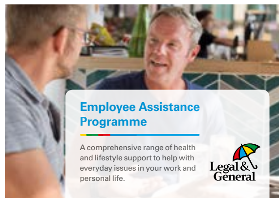
Employee Assistance Programme wallet card