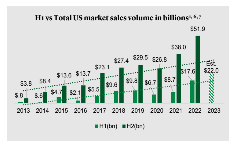
Half-year 2023 figure based on Legal & General Retirement America's estimation.

Additionally, we saw four transactions in the market of over $1 billion each close in H1, including AT&T which settled at $8.1 billion<sup>3</sup> in Q2 in liabilities.